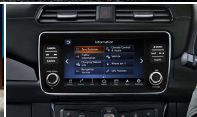
Floating 8" Infotainment Screen